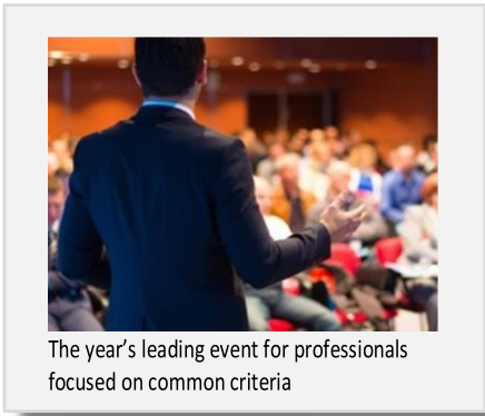
The year's leading event for professionals focused on common criteria

30 October-1 November 2018 | Hilton Amsterdam | www.icconference.org